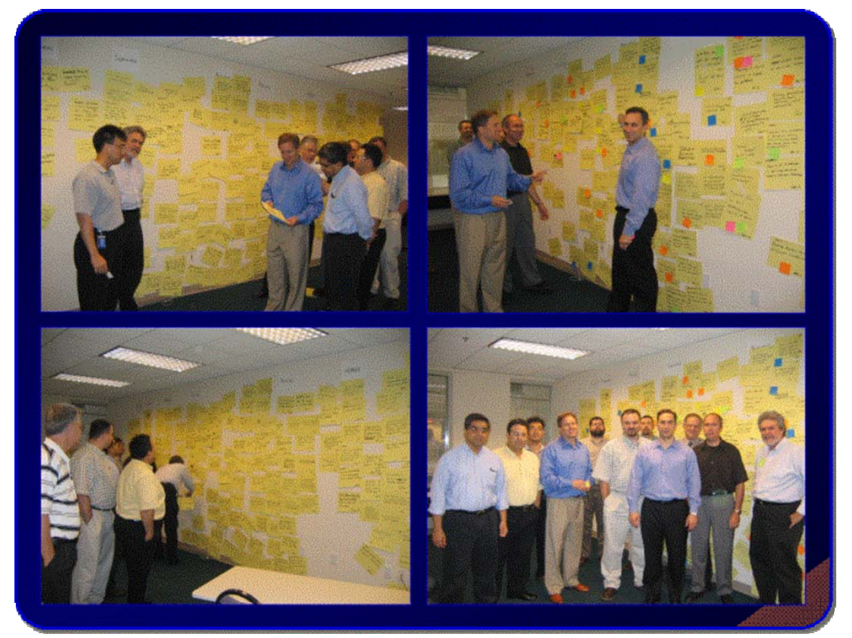
Figure 2. Analysis of Concerns for Public Data Networks

Each concern was then assigned to one of 8 Task Groups. The 8 areas associated with these tack Groups provided comprehensive, systematic coverage of communications infrastructure (Figure 4).