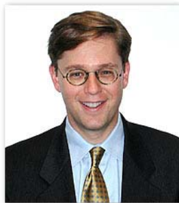
Kevin J. Martin, FCC Chairman

The President chooses one of the Commissioners to serve as the Chairman.