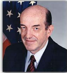
Michael J. Copps