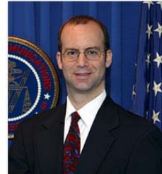
Jonathan S. Adelstein

All Commissioners, including the Chairman, have five year terms, and are appointed by the President and confirmed by the Senate.