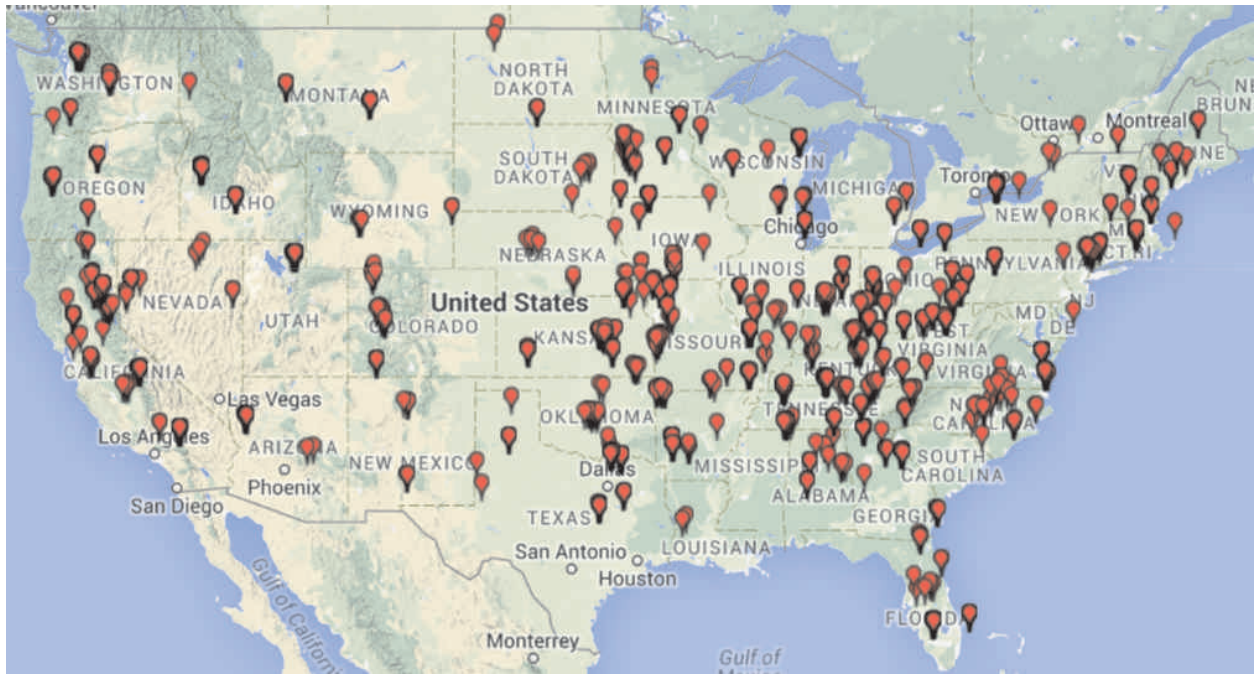
Figure 5: Base Stations Using 173.3375 MHz