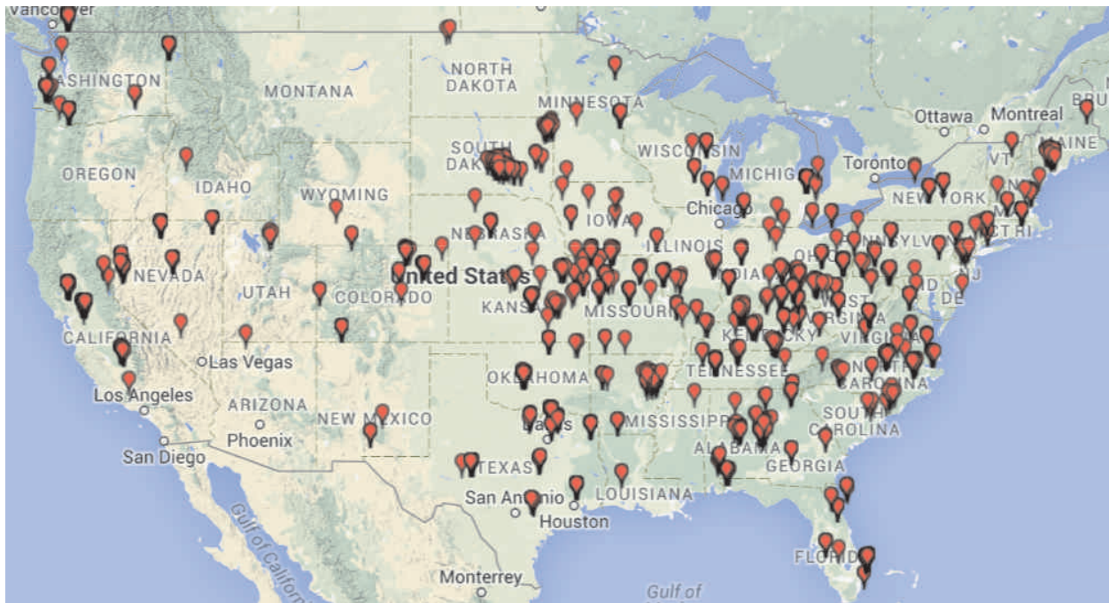
Figure 6: Base Stations Using 173.3625 MHz

16. As evident from the above figures, use of these frequencies tends to occur in clusters. In addition, there is not a large embedded base of telemetry systems on these channels, and these systems tend to be geographically scattered. This means that there are large sections of the country where these channels are essentially fallow, and thus could readily accommodate mobile repeater use. Given the relatively light use of these channels coupled with their geographic separation we conclude that these channels can accommodate VRS use, without unduly impacting telemetry use